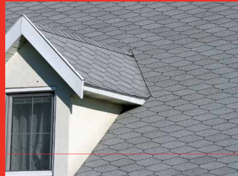
Park Molenheide - Belgium